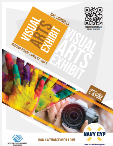
FULL PAGE PREVIEW MAGAZINE AD (21x29.7 cm)