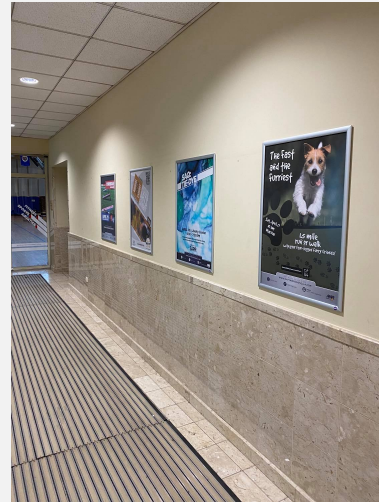
LARGE POSTER (A1 size)