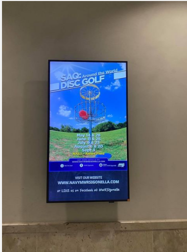
DIGITAL TVs (50")