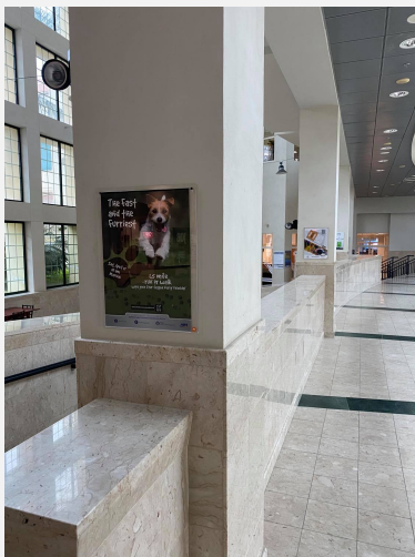
SMALL POSTER (38x51 cm)